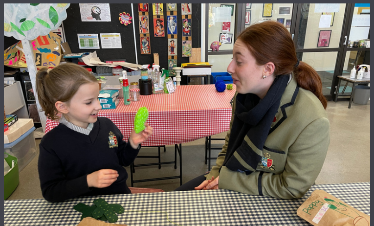
Visual Arts Mentor Program 2023 - Senior campus and Turner house